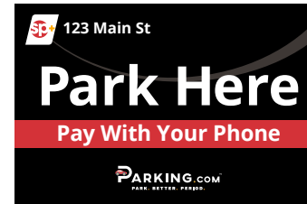
4' x 6' Horizontal