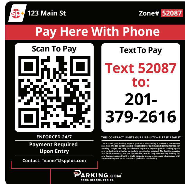
32" x 32" Pay Sign

Note: The contact information goes below Payment Required Upon Entry on the 32" x 32" Pay Sign as shown above.