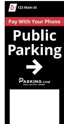
6' x 4' Vertical