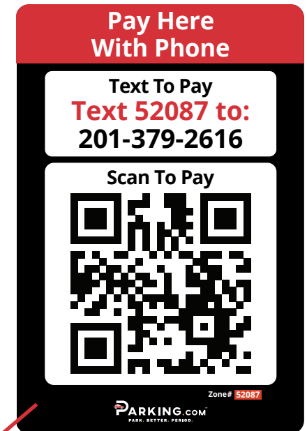
32" x 48" Back of Awning Sign