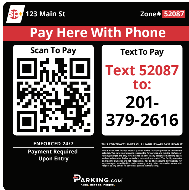
32" x 32" Pay Sign