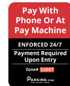
16" x 24" Pay Method Sign Pole Mounted (not shown in photo)