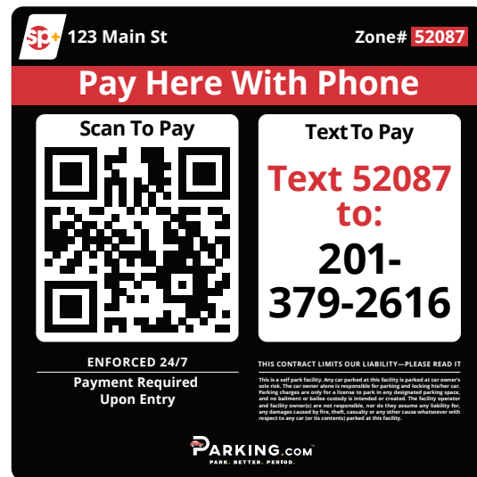
32" x 32" Pay Sign