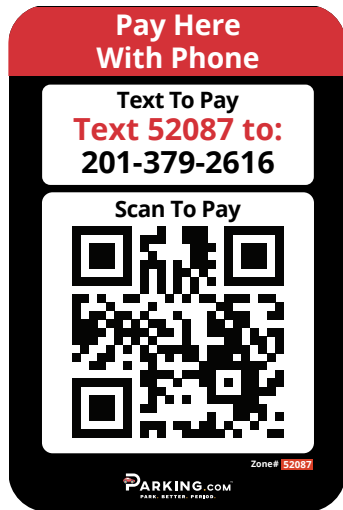
12" x 18" Pay Machine Side Sticker